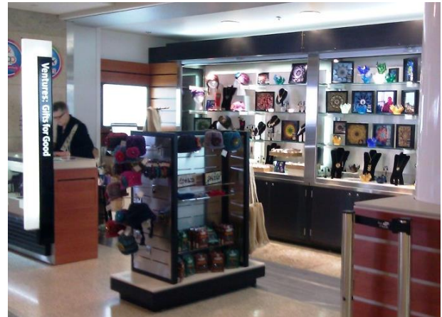
Visit our new Ventures retail kiosk at SeaTac International Airport. Concourse C!